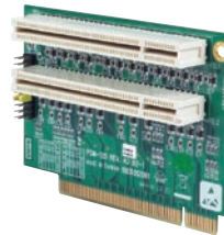
PCM-120 2-slot PCI Riser Card for 5.25" Biscuit SBCs