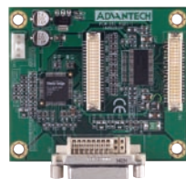
PCM-261 LVDS/TTL to DVI Module