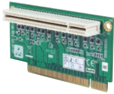
PCM-110 1-slot PCI Riser Card for 5.25" Biscuit SBCs