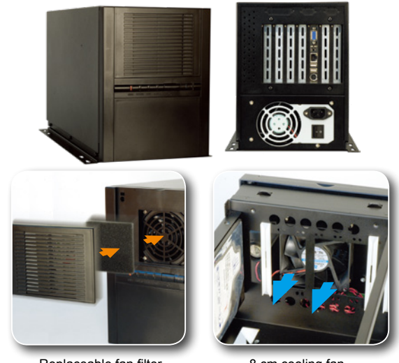
Replaceable fan filter

CD-ROM and HDD are not included in package.