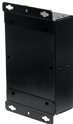
Wall Mount Illustration