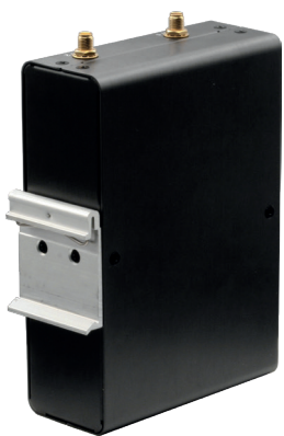
DIN-Rail Mount Illustration